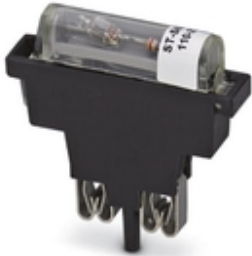
Fuse plug, nominal current: 6.3 A, length: 45.4 mm, width: 9.9 mm, color: black

Please be informed that the data shown in this PDF Document is generated from our Online Catalog. Please find the complete data in the user's documentation. Our General Terms of Use for Downloads are valid ( http://phoenixcontact.com/download )